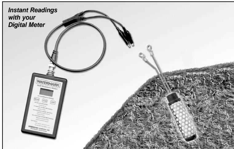
Instant Readings with your Digital Meter

The soil acts as a reservoir to store water between irrigations, or rainfall events, so that it is available to the crop or plants as needed for healthy growth. The purpose of using sensors to measure soil water is to give you a better understanding of how fast water is being depleted in the different areas of your field, so you can better schedule your irrigations and correctly evaluate the effectiveness of any rainfall. By reading the sensors 2-3 times between irrigations, you will gain an accurate picture of this process over time, and develop an irrigation scheduling pattern that meets your crop's "need" for water. This eliminates the guesswork, can result in water savings, lower pumping costs and eliminate excess leaching of nitrogen due to over irrigation.