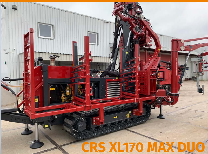
CRS XL170 MAX DUO