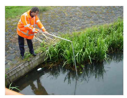
Using the sediment level stave with elbow