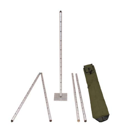
Sediment level stave, standard set

The sediment level stave is part of the standard kit to measure the depth of sediment down to a depth of 4 m. The set contains four extendable measuring rods made of anodised aluminium with threaded connections. The rods are 1 m long and are 25 mm in diameter. The sediment measuring rods are marked every 5 cm. The kit is supplied including a stainless steel sediment grid, core point and carrying bag.