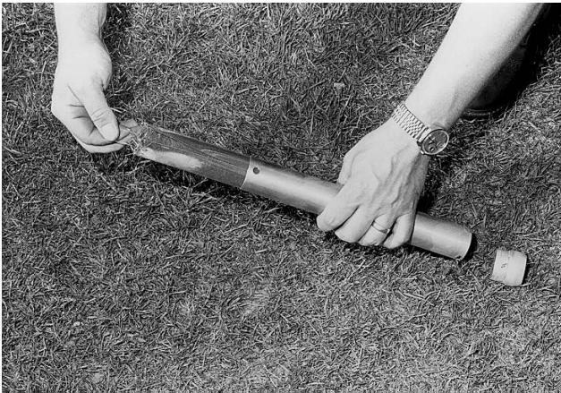
A sample is removed from the tube

During sampling air and/or water will escape from the tube via the discharge opening, the rubber tyre (2) prevents re-entry.