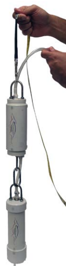
Aardvark permeameter module and pressure regulator