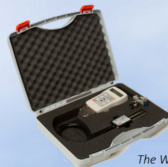
The WET Kit

PROVEN APPLICATIONS IN PRECISION HORTICULTURE AND SOIL SCIENCE