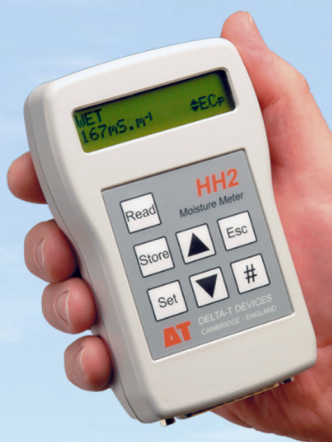
Readout and data storage are carried out with the HH2

It is exceptional in its ability to measure pore water conductivity ( EC_p ), the EC of the water that is available to the plant.